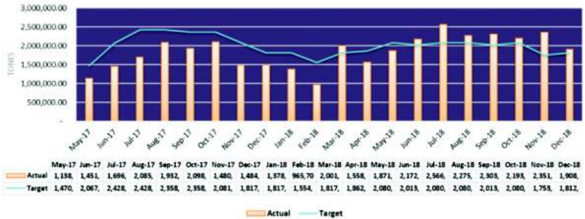
Material Movement year 2017/2018